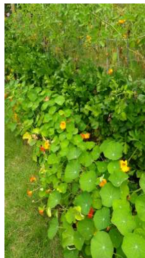
SPUR nasturtiums and tomatoes