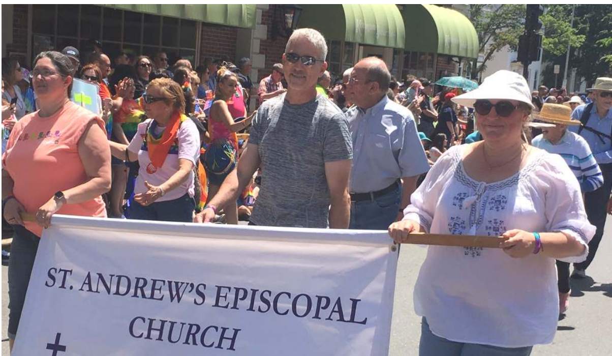
Marching at the North Shore Pride Parade last Saturday