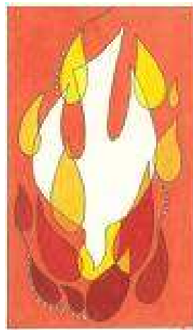
Pentecost Sunday June 9