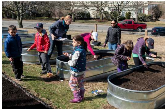
Many hands on board for SPUR planting.