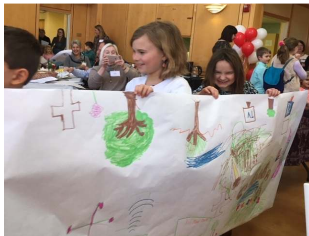
Capital Campaign Parade